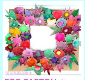
EGG CARTON flower