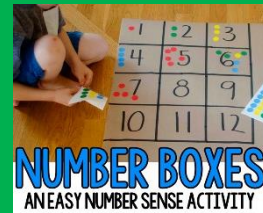
NUMBER BOXES AN EASY NUMBER SENSE ACTIVITY