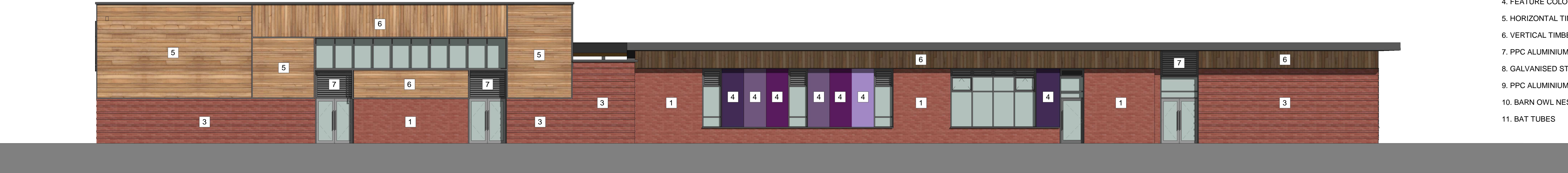
B SOUTH-EAST ELEVATION - PROPOSED 1 : 100