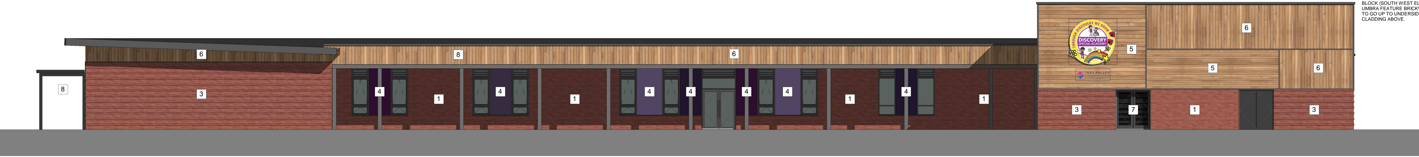
A SOUTH-WEST ELEVATION - PROPOSED 1 : 100