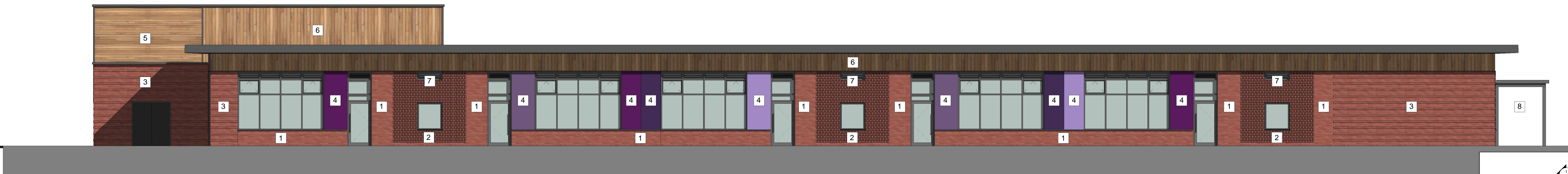
C NORTH-EAST ELEVATION - PROPOSED 1 : 100