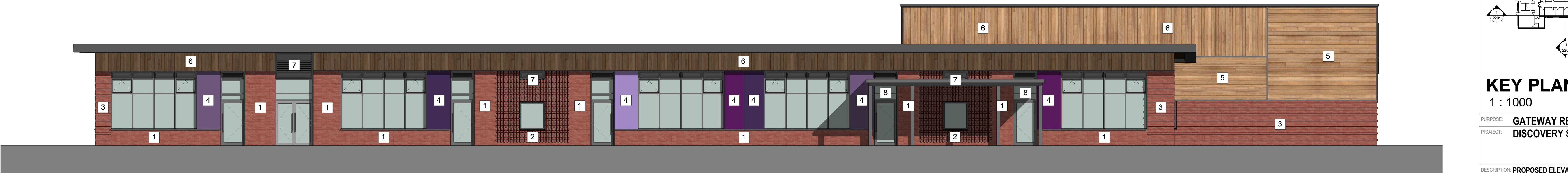
D NORTH-WEST ELEVATION - PROPOSED 1 : 100