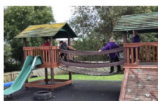
Zahida's Class- Gross Motor Well-being