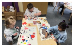
Grace's Class-Maths, Shape