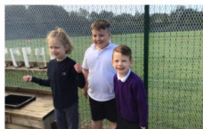
Grace's Class- DT, Rain Gauge